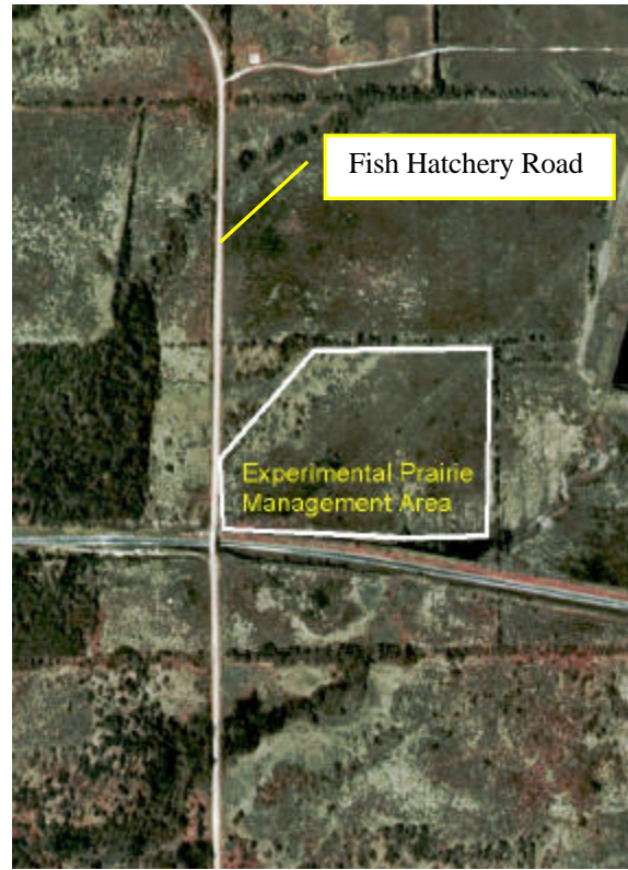
Figure 2. Plot layout in the Lewisville Research Prairie (from Windhager 1999).